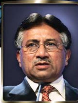
March 2, Tuesday PERVEZ MUSHARRAF