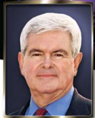
April 7, Wednesday NEWT GINGRICH

What do a famous physician, the prior U.S. Secretary of State, the former president of Pakistan, and a well-known conservative politician have in common?