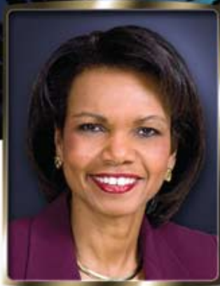
February 12, Friday CONDOLEEZZA RICE